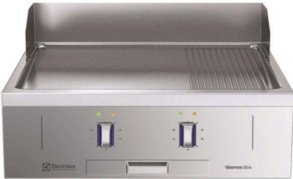
588539 (MBHOBBHOAO) Electric Fry Top with smooth and ribbed chrome Plate, one-side operated with backsplash